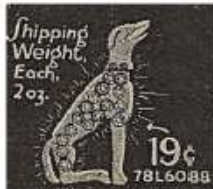
Montgomery Ward Fall and Winter 1928-29 - dog novelty pin