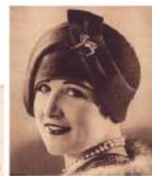
Lane Bryant Fall and Winter 1928-1929 "held by one of those good-looking metal animal pins that are so popular now."