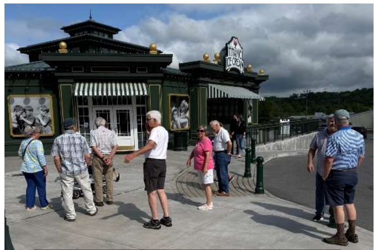
And now it's time for a Titanic-sized ice cream.