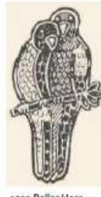
1930 Bellas Hess - Love Bird pin.