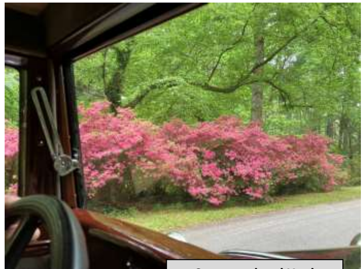
Some azaleas! Yay!