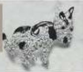
Chas. L. Trout Co 1931 catalog - dog pin