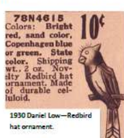
1930 Daniel Low—Redbird hat ornament.