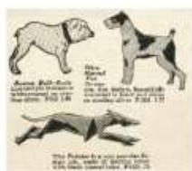
Daniel Low 1930 - dog pins