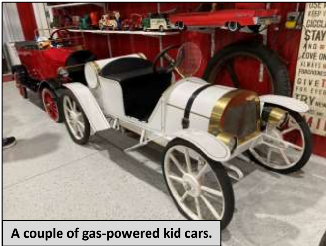
A couple of gas-powered kid cars.