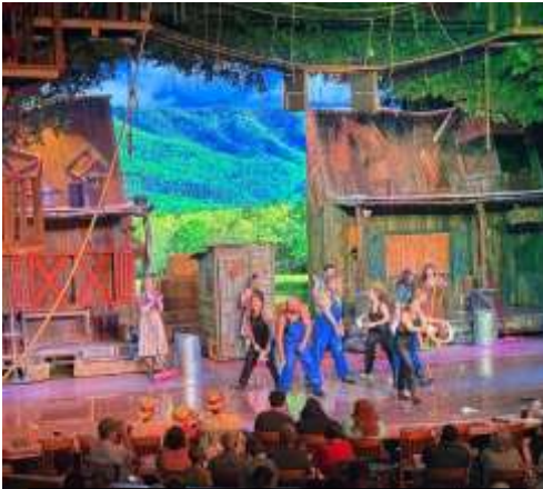
The Hatfields & McCoy's, at it again!

We extend our sincere thanks to the Georgia Region for organizing another successful and enjoyable outing.