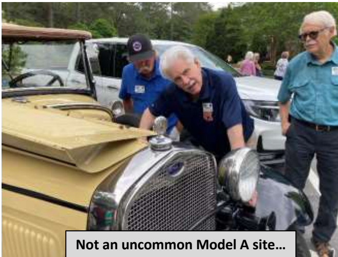
Not an uncommon Model A site...