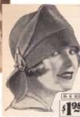
Novelty pins for hats - The Charles William Stores Inc Spring and Summer 1928.

Birds of a feather flock together, and that is true for some of these pieces.