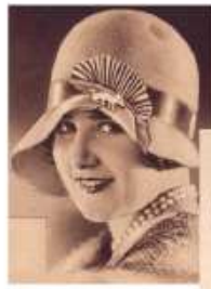
Lane Bryant Fall and Winter 1928-1929—metal animal pin on hat.